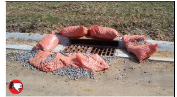
Poor placement of stone bag inlet dam. Bags work well if used properly and maintained. Bags must form a dam around the inlet with no large gaps.