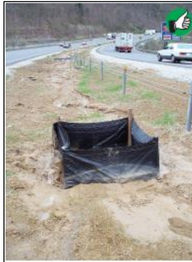
Good application of silt fence frame to protect inlet. Use wire fence backing to reinforce frame, or diagonal bracing across top of stakes. Make sure fence is trenched in to prevent bypasses or undercutting. Inspect and remove sediment as necessary after each rain. Expect a more frequent replacement schedule for silt fence drop inlet protection.