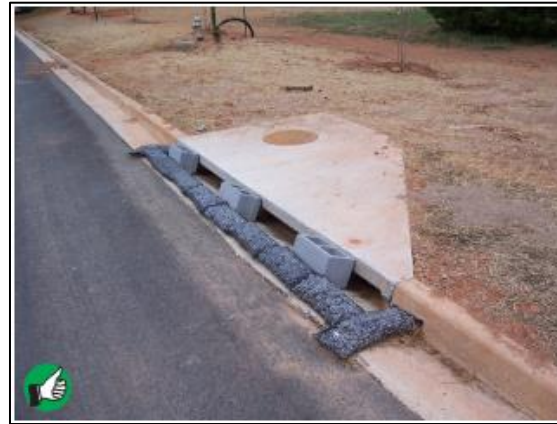
Excellent use of rock-filled mesh tubes to control sediment at curb inlet. Concrete block spacers keep tubes from moving into - and clogging - the inlet during heavy flows.