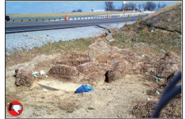
Example of poor inlet protection and inadequate maintenance.