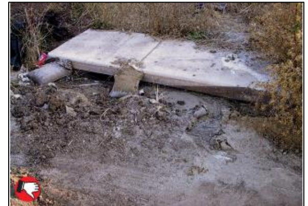
Poor placement and poor maintenance of stone bag inlet ponding dam. Accumulated sediment must be removed and dam should be repaired.