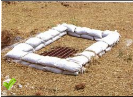
Inlet protection berm construction of half-filled stone bags. Use #57 rock, overlap bags to eliminate large openings and rapid flow-through.