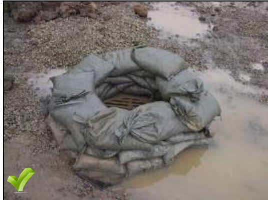
Stone-filled bags of either burlap or woven geotextile fabric should be used. Leave one bag gap in the top row to provide a spillway for overflow.

Properly installed inlet protection keeps sediment and trash out of local waterways, including streams, rivers, and lakes, and protects our environment.