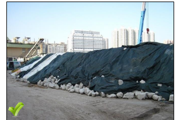
A solid-fabric waterproof material can be used to cover stockpile areas.

Covering stockpiles is an effective method of soil stabilization and helps prevent sediment runoff.