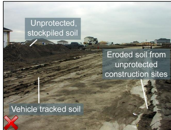
A silt fence should be added around the stockpile to provide a barrier between the road and the stockpiled soil. Whenever possible, stockpiles should be located away from drainage conveyances.