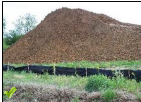
Good application of using a silt fence around the stockpile to protect a stream in the foreground from direct runoff. The stockpile should be seeded and mulched for additional protection.