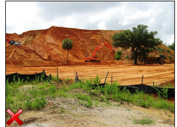
Poorly maintained silt fence surrounding the large stockpile area.